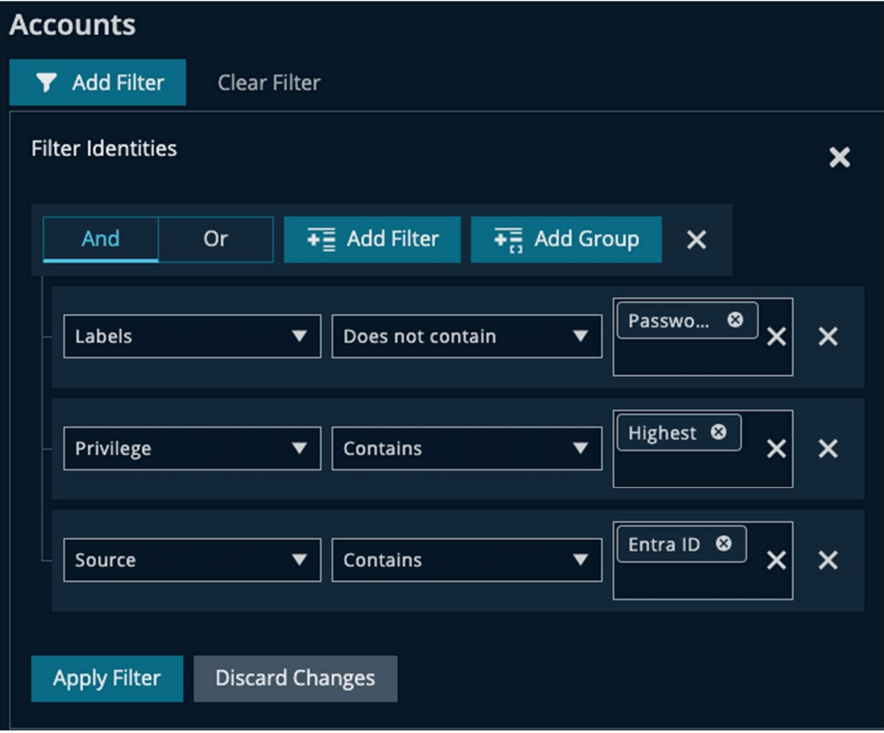
Figure 2 - New advanced filter

BeyondTrust Identity Security Insights empowers you with advanced search capabilities that let you tailor account displays based on complex filter expressions. But there's more. We understand the critical need to identify potential gaps in specific ways. For example, quickly identify privileged Entra ID accounts not managed by Password Safe. That is why we enable users to leverage the powerful "Does not contain" operator when filtering for labels. Now, you can filter for accounts that "Does not contain" the label "Password Safe managed" to gain easy visibility into accounts outside of your traditional PAM controls, potentially harboring hidden security risks.